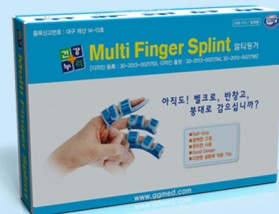
< Refill >