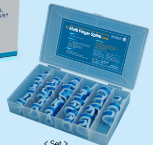
< Set >